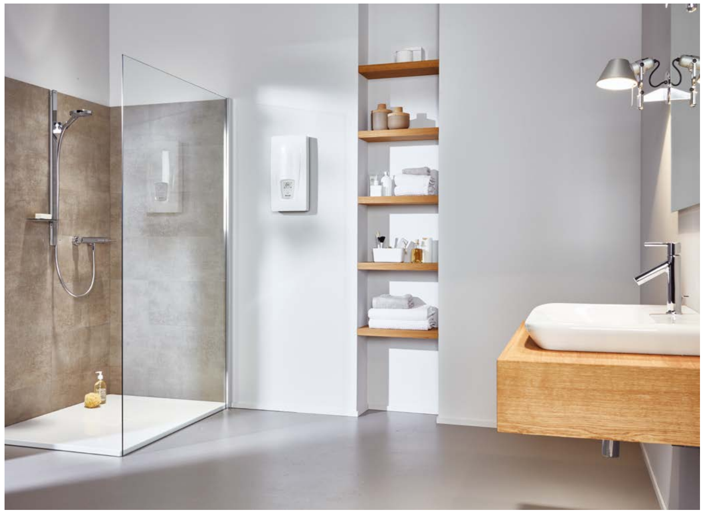
Subject to technical changes and version changes. Errors and omissions excepted. Date of publication: 09.20